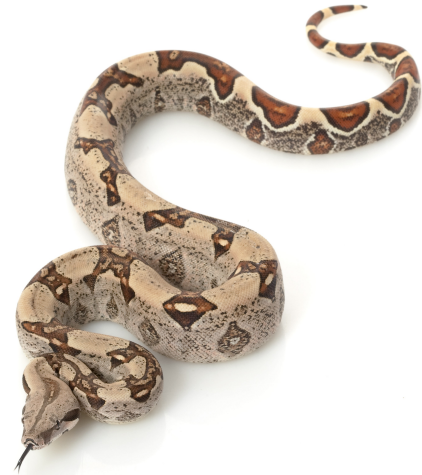
Red-Tailed Boa Constrictor

Both types of snake use their forked tongues to smell. Those that hunt at night can widen the pupils of their eyes to let in more light. They also use heat sensors on their lips to find warm-bodied prey such as rodents.